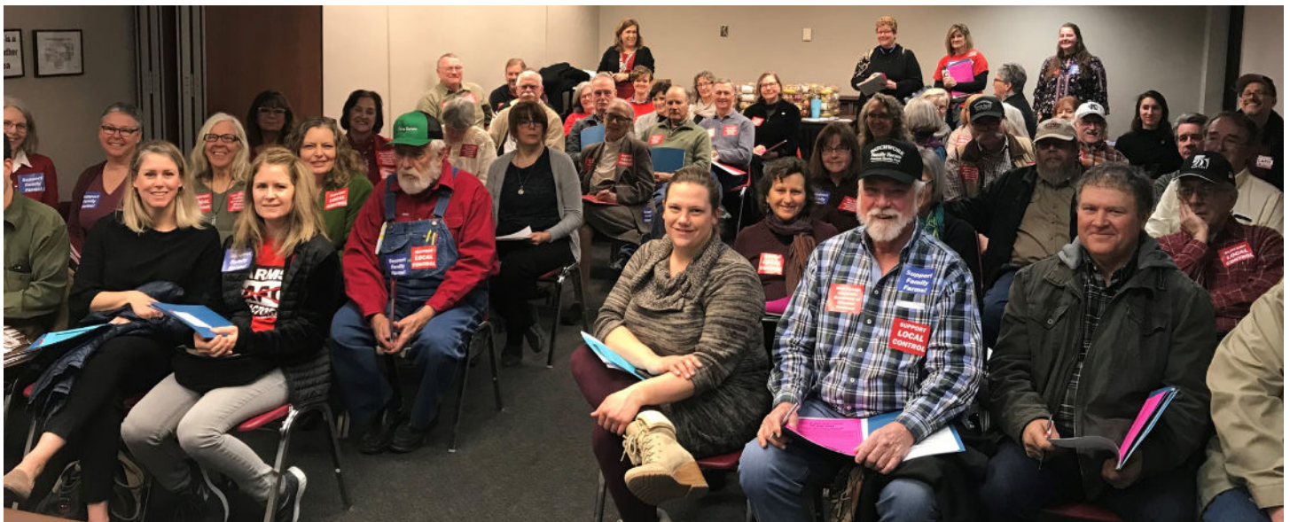
CFFE Farmer members of the Missouri Rural Crisis Center.